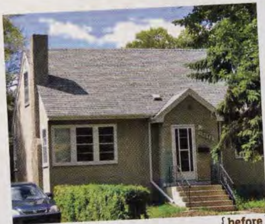
{ before }

Trimwork spruces up a plain facade, while a gabled addition makes room for a family's growing boys By DEBORAH SNOONIAN + Photo Illustration by HOWARD DIGITAL