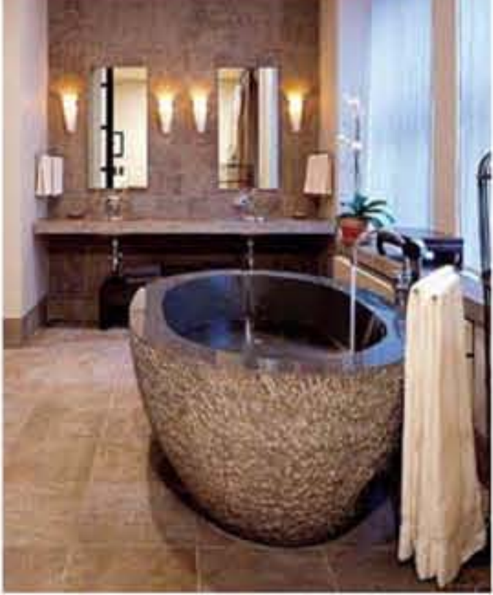
A granite soaking tub from Stone Forest comes in blue-gray, beige and black.