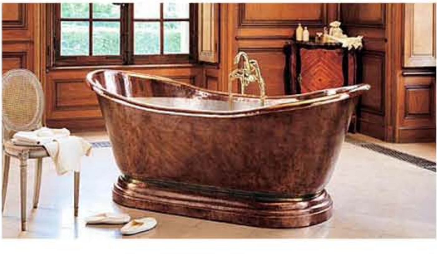
Herbeau's Medicis is a luxurious copper and nickel tub for two.

Or maybe you're looking for something to help keep her warm after she finally pulls herself out of the water. Lavender or Cranberry Heatable Booties from The Body Shop (www.bodyshop.com, 1-800-263-9746) come lined with fleece and removable scented packs meant to relax and calm. Pop the foot warmers in the microwave for one minute and slip them on. Cost: $20-$25.