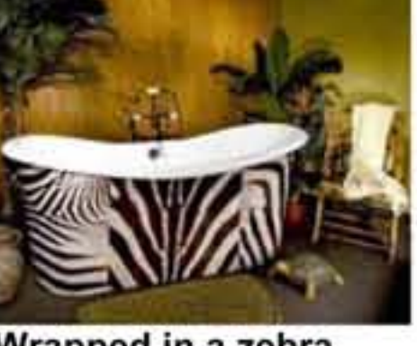
Wrapped in a zebra print, Nottingham Brass deep slipper tub celebrates the wild life.

But be forewarned. This tub -- which can be ordered at Tile & Designs on Spahr Street in Shadyside -- weighs in at a whopping 1 ton and requires delivery by crane. As such, it's most often used in new construction. Information: www.stoneforest.com, 1-888-682-2987.